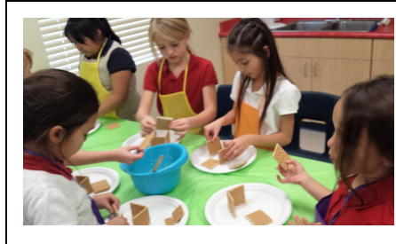
Cooking Class 2015-2016